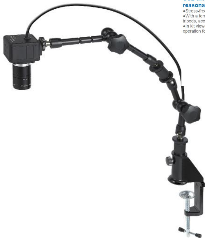
L-835 USB CAMERA

Magnification: 8.7 ~ 250x *When viewing in 24 inches wide monitor